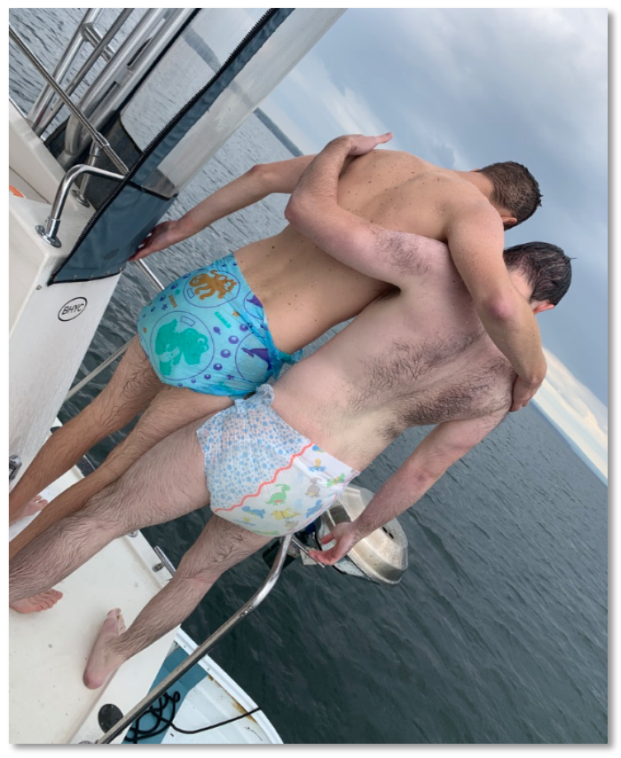
THE 'LUVS BOAT' BOAT FAQs - 2020 EDITION